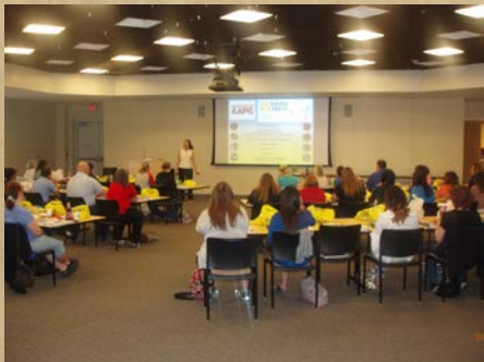
"More Rocks in Your Head" workshop at the Midland Petroleum Museum with 45 area teachers in attendance.