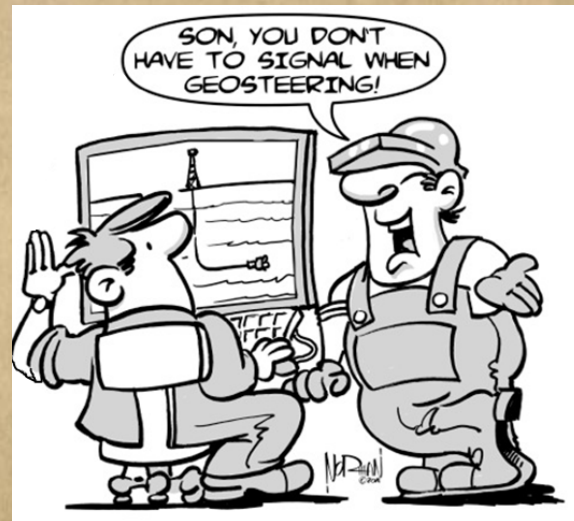
80 attendees at free SWS / DPA sponsored Short Course "Three Ps of Geosteering: Principles, Practice, and Pitfalls"