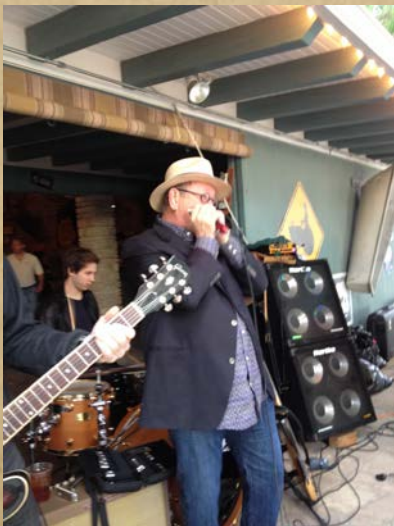
Shack in the Back dinner social.