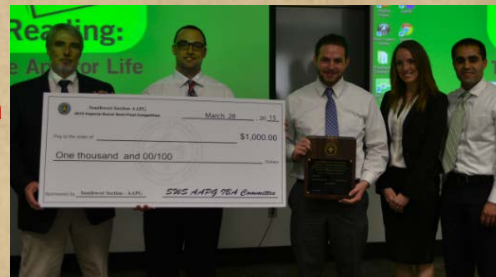
2 nd Place: TCU