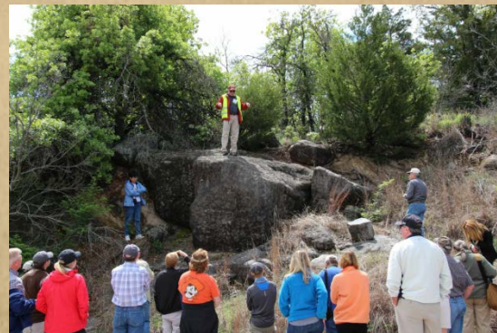
Field Trip: Wichita Mountains