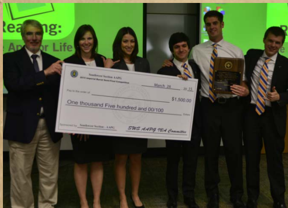
1 st Place: UTEP