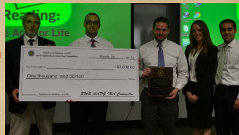
2 nd Place: TCU