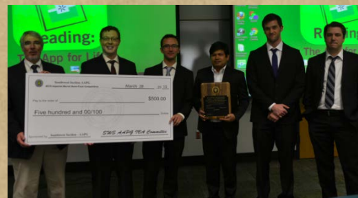
3 rd Place: UTA